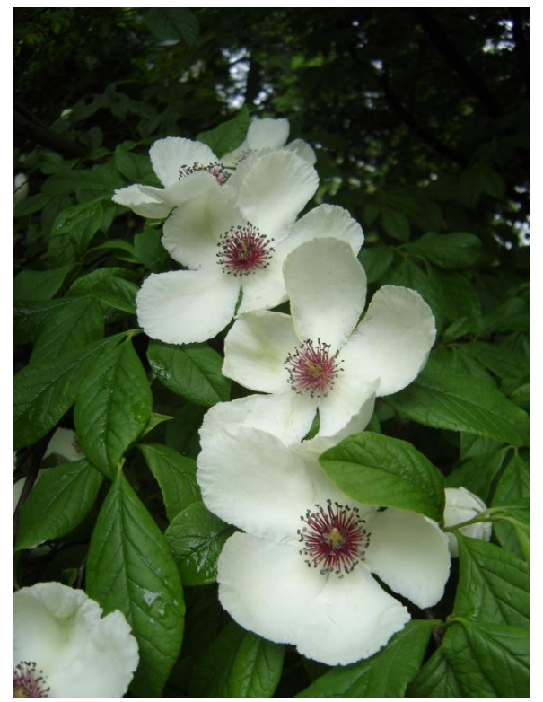
7. An article on the genus Stewartia (here S. malacodendron ) was published in the well-known Dutch journal Dendroflora

Sharing knowledge and experiences is also possible through lectures and publications. The Director gave presentations for the Centre of Living Languages in Leuven, on yellow flowering Magnolia during the Magnolia study weekend at Wespelaar and also at the Yorkshire Arboretum in the UK. Several articles have been published in 2013: dendrological notes, excursion reports, on systematics of the family Theaceae and the position of Stewartia in that family, and an article on the genus Stewartia in Dendroflora, the Yearbook of the Dutch Dendrological Society.