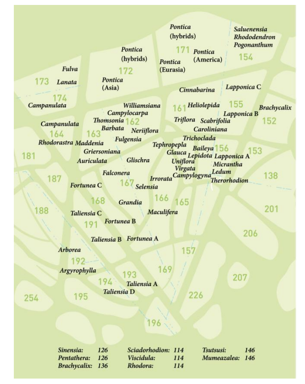
1. Map showing the major subsection within the genus Rhododendron and their location in the Verlat wood of the Arboretum

based the available on most recent classifications as published in international scientific journals. Our database is now reflecting these recent understandings of the relationships between species. Our collection of Rhododendron species was further enlarged with missing taxa, especially in the Lapponica and related subsections, and many specimens have been planted in their final location under the protection of the large Corsican Pine trees of the Verlat Wood.