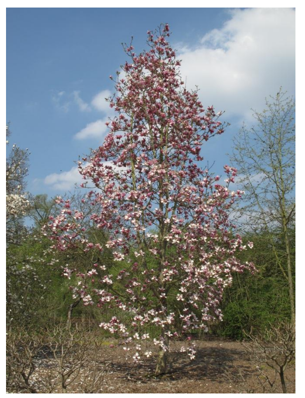
3. Magnolia 'Wim Rutten'. An upright, floriferous selection named by Arboretum Wespelaar in memory of Magnolia breeder Wim Rutten