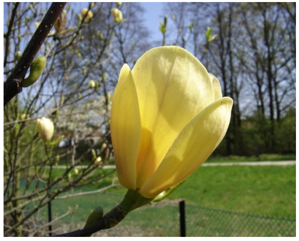
2. Magnolia 'Butterbowl' was registered in 2013. A good yellow flowering Magnolia with bowl shaped flowers

Since a few years our white oaks, especially the native common oak ( Quercus robur ) are suffering from severe infestations by the oak processionary caterpillar . These caterpillars are not only a problem for the trees, they also pose a human threat because of their poisonous hairs which may cause skin irritation and asthma. This year we have tried to reduce this pest through biological control. This has proven to be successful and we are planning a new treatment in the spring of 2014 to help the oak trees to recover and get them healthy again and also to substantially reduce the risk to the public.