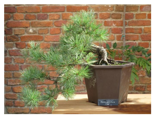
4. Pinus parviflora as a bonsai

average interest. In the summer months we keep the plants in a new shade hall where they are better protected from heat, drought and direct sunlight. The daily maintenance of the bonsai collection falls under the responsibility of our own staff but we benefit from the skills of a volunteer who is in charge of the more challenging jobs such as pruning and repotting of the plants. The bonsai collection is undoubtedly an important added value for our collections and it helps us in creating a firstclass Arboretum. The official inauguration of the collection was held on a sunny autumn day in October and some 70 invitees participated in this event.