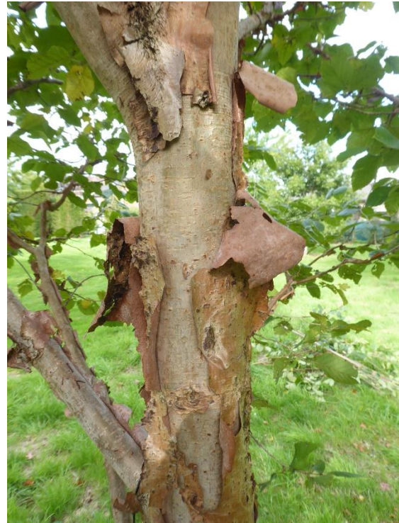
Photo 12. We shared material of Corylus fargesii , with its uniquely beautiful peeling bark, with the National Academy of Sciences of Ukraine.

We are frequently consulted by scientific institutions or botanical collections with regards to the plants we are growing. After evaluation of the request, we share information, observations, seeds, leaf material or cuttings for scientific research.