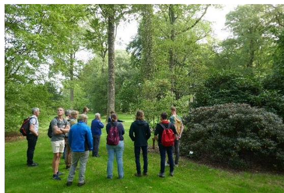
Photo 13. More than 70 gardeners from the various V.B.T.A. member gardens visited the Arboretum on September 28.

meetings (region of Flanders, and Wallonia plus Brussels) with several of the most important contributors to the database in order to encourage and increase the number of yearly measurements. In 2017 we also started linking available photos to the BELTREES accessions. In the past seven years, 8,680 photos were linked and uploaded. These photos can be accessed on the website of Arboretum Wespelaar.