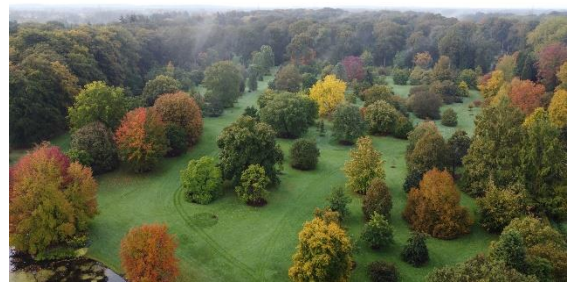
Photo 4. Autumn colouring got started very late in 2023.

This year we started with a different mowing regime in part of the Magnolia meadow. Instead of mowing on a weekly basis, we only mowed once in early summer. This creates a much more natural effect and the diversity in management makes for a direct increase in biodiversity. In addition, the grass was removed after mowing in order to create a more flower-rich meadow in those areas over time. The result after one year is already an aesthetic success that was greatly appreciated by the visitors.