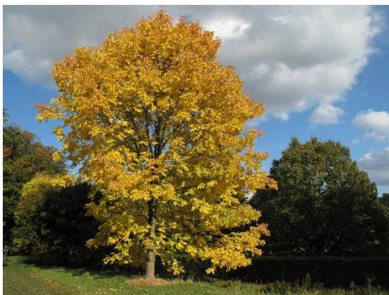
Photo 6. Fraxinus americana 'Bash Bish Falls' was registered as a new cultivar in 2023. It was selected for its magnificent autumn colours.

have significantly increased our efforts and our team continues this major inventory round at the Arboretum and the dendrological collections of the surrounding private estates of Herkenrode , the Park of Wespelaar , the Potager de Wespelaar and Bosveld . This important and valuable work continued in 2023 and a total of 162 beds have been thoroughly inventoried. During this inventory, each plant is localised within a certain bed, its health status is assessed, the identity is verified if possible and/or as needed (with extra attention this year to the following groups: arborescent Fabaceae, Carpinus , Paulownia , Rhododendron , Meliosma , Cyclamen and Iris ), and the label is placed on a healthy branch clearly visible for our collaborators and visitors. The perennials are also inventoried per bed, but usually this is done in two stages: once in (early) spring in order to identify bulbs and spring flowers and a second time in the summer period when many perennials and grasses are at their peak. Inventory of flowerbeds was very limited in 2023 and a new, improved effort will be needed in 2024 in order to keep our perennial collection database up-to-date.