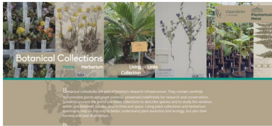
Photo 9. The Botanical Collections homepage where the databases of 16 participating botanical gardens and arboreta are consultable on a single platform.

The woody plant information is shared – by means of a yearly upload of our data – with two other on-line searchable databases . In 2003 nine Belgian gardens made their database of living plants accessible via one website: PLANTCOL. In May 2023, the successor to this platform saw the light of day: botanicalcollections.be. This online platform brings together the living plant collection data of 25 Belgian gardens and arboreta. All these gardens together hold no less than 83,000 specimens belonging to 25,000 different taxa, well documented, and therefore invaluable for research, horticulture, garden tourism and the preservation of plant species for the future. The second online database we share our data with is PLANTSEARCH of Botanic Gardens Conservation International (BGCI) which is a global database of living plants with over 1,100 contributing institutions. PlantSearch then provides us with a list of taxa that are included in the IUCN Red List . We use the most recently published Red Lists received via BGCI to update our list. The 2023 update resulted in one extra taxon ( Juglans cinerea : long present in our collection but only recently indicated as endangered) in the category ‘endangered’. Sadly, we also lost some important threatened species. In the category critically endangered we lost Rhododendron mianningense . In the category endangered we lost Chamaecyparis formosensis (not hardy),