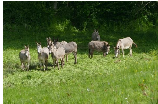
Photo 16. In 2023 we experimented eco-pasturing with donkeys in some areas of the Arboretum.

to use large machines, so certain areas are mown by the Arboretum staff. If possible, the product of the mowing is recycled by a farmer, who makes small bales. Anything that cannot be baled is exported so as not to enrich the environment. Wetlands also require special attention and are managed to prevent colonisation by woody plants.