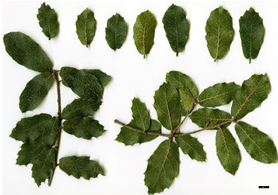
Photo 10. Arboretum Wespelaar is globally the only garden that grows the threatened Quercus hintoniorum according to the BGCI PlantSearch database.

Arboretum Wespelaar is globally the only garden that grows threatened Ilex brachyphylla , Quercus hintoniorum , Carpinus faginea and Taxus chinensis according to the BGCI PlantSearch database and there is only one other collection that lists Magnolia sinostellata , only two other collections with Magnolia decidua and 3 other collections with Carpinus eximia .