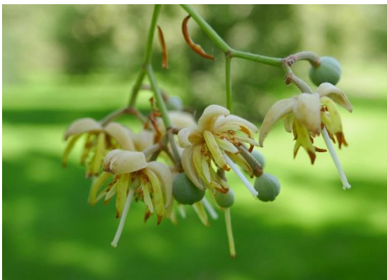
Photo 3. In August, we had a good amount of flowering for the first time on Tilia endochrysea .

One specimen of Stewartia malacodendron showed a beautiful streak of red in the otherwise pure white flowers. In August, we had a good amount of flowering for the first time on Tilia endochrysea . This species is extremely rare in cultivation and stands apart from other members of the genus because the peduncle is joined to the floral bract only at its base.