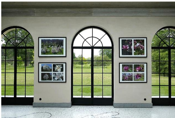
Photo 11. The Magnolia photo exhibition in the Artois Pavilion attracted many visitors.

In the Artois Pavilion, the existing photo exhibition on the history of the Arboretum was replaced by a Magnolia exhibition . 53 high-quality photographs in 20 frames provide a beautiful and captivating display in the new pavilion. In addition, visitors receive a leaflet with further information about what is on display. This text is offered in three languages (Dutch, French and English) and can also be consulted on our website.