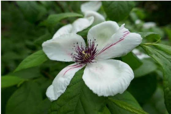
Photo 2. One specimen of Stewartia malacodendron showed a beautiful streak of red in the otherwise pure white flowers.

One specimen of Stewartia malacodendron showed a beautiful streak of red in the otherwise pure white flowers. In August, we had a good amount of flowering for the first time on Tilia endochrysea . This species is extremely rare in cultivation and stands apart from other members of the genus because the peduncle is joined to the floral bract only at its base.