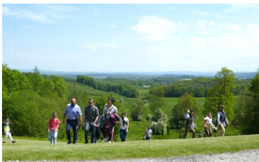
Photo 14. The site at Marche-en-Famenne was inaugurated on 20 May 2023 for everyone involved with the project to date.

until 19 November. To keep the public duly informed, a dedicated website was created as well as an own Facebook and Instagram account. As in Wespelaar, visitors to Marche also receive a leaflet with the 10 highlights of the moment. This leaflet is available in both French and Dutch. About 400 people visited the Arboretum de Marche. 11 groups and several specialists or specific groups also visited, e.g. the city's College of Councillors, the Belgian Dendrological Society and the DDG Regionalgruppe Luxemburg-Eifel-Saarland.