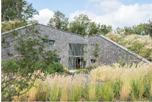
Photo 15. View towards the visitor centre, nicely planted with shrubs, perennials and grasses.

plants also saw very significant growth in 2023 with the planting of about 840 specimens.