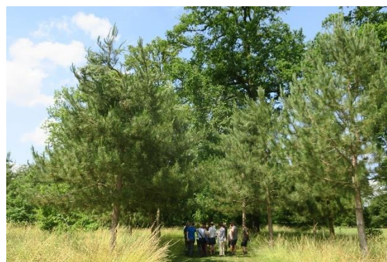
Photo 1. The young pines were thinned in 2023 but still provide enough shade in summer for a group of visitors.

back. However, the wind now also has free play especially because the neighbouring double beech avenue in the Park was cut the previous year. More than 40 per cent of those trees were dead due to ageing and successive droughts causing severe decline and dangerous situations. For the time being, the impact of the few storms has been relatively limited: some evergreen, tall holly trees ( Ilex ) were blown over and some old pedunculate oaks ( Quercus robur ) lost a few heavy branches. Wait and see what happens in the years to come.