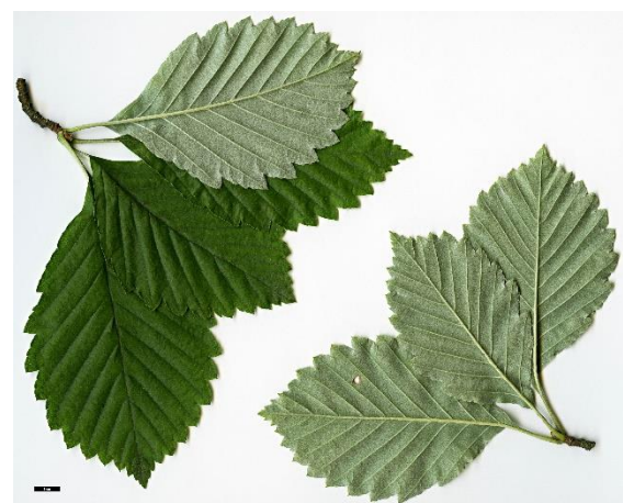
Photo 8. Sorbus japonica as an example of one of the high-resolution scans available on the Arboretum's website.

In 2023 our website had 21.432 users (vs. 25.345 in 2022) and 81.439 pageviews (vs. 91.726 in 2022). However, the 2023 figures are incomplete due to a nearly two-month gap because of switching of analysis software. Apart from the homepage and “contact and visit” page, the most visited pages in 2023 were the Beltrees database page, the database of woody plants in Arboretum Wespelaar and the database of images linked to the identification keys.